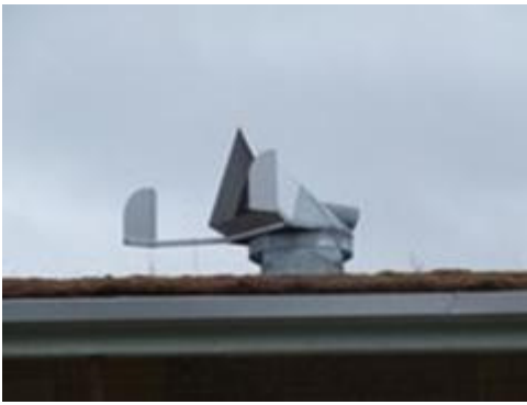
Left. Roof top evidence of the fresh air ventilation system that runs through the homes.