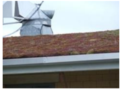
Right. Closer view of the roof reveals green roof technology.