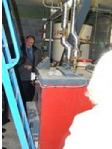
The delegation split into smaller groups, this one visiting the wood chip boiler house.